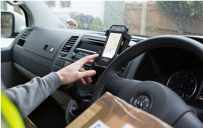
Properly installed Panasonic Toughpad® FZ-N1 handheld tablet

In conducting fleet audits and ride alongs over the years, our team has seen just about every form of “creative” mobile offices set up in vehicles – from uncertified and poorly installed docks, to a tangled mess of wires, even power inverter solutions used to cool drinks and charge wireless boosters at the same time!