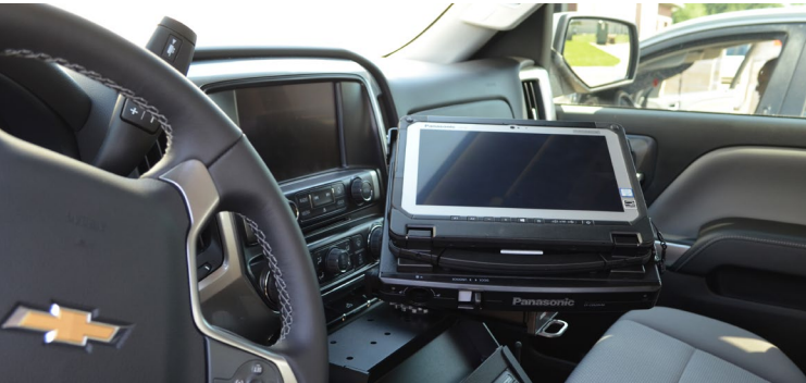
Properly installed Panasonic Toughbook® 20 2-in-1 detachable laptop

Whether you have dozens of cars or hundreds of vans, the number one lesson learned from assessing and recommending Toughbook in-vehicle solutions is the importance of conducting a two or three vehicle pilot program.