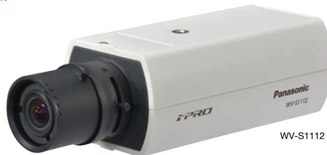
Lens : Optional