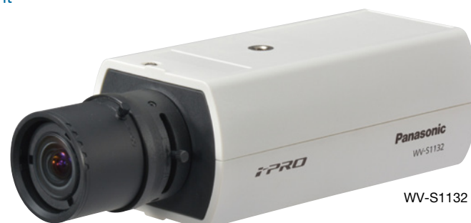
Lens : Optional